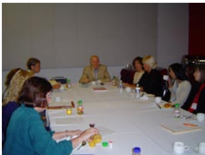
Section Council Meeting