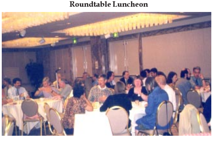
Group Processes Participants ◆